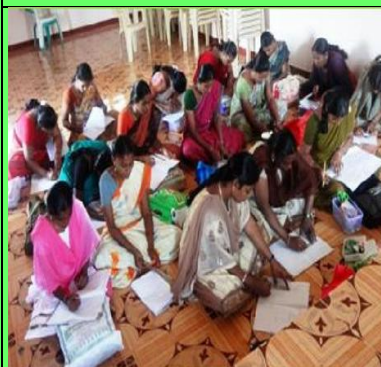
During the theoretical training-2