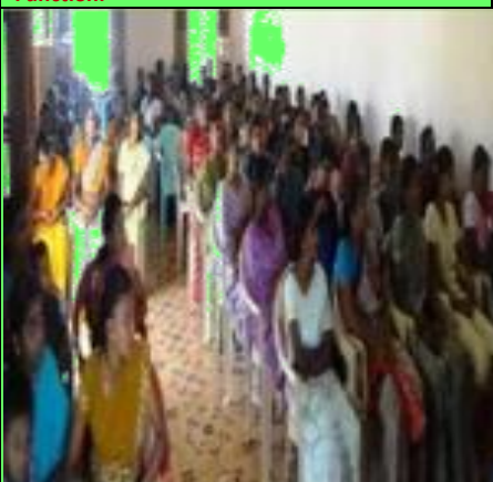
Beneficiaries during the training