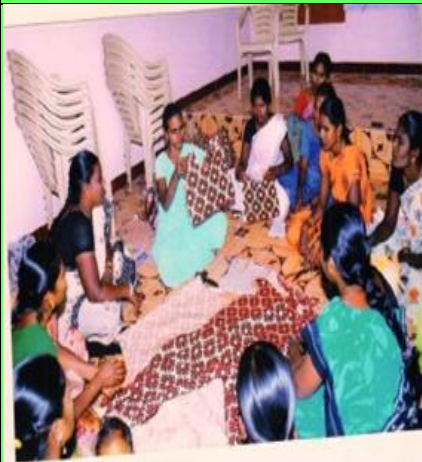
Beneficiaries Displaying the finished the girls Kurtha