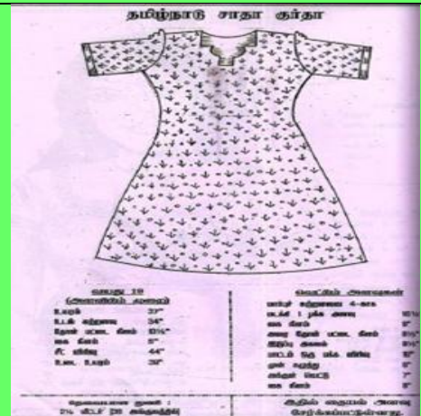
Tamilnadu Simple Kurtha