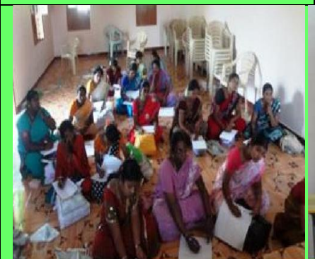
During the theoretical training-3