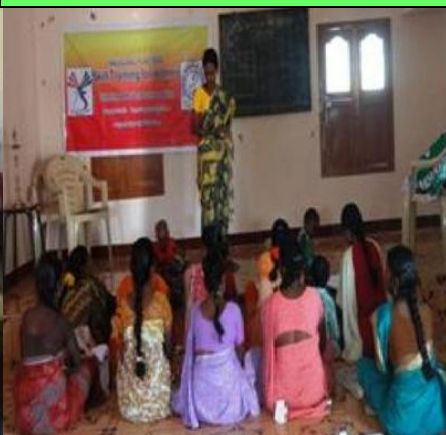
Theoretical Information During the theoretical training-1