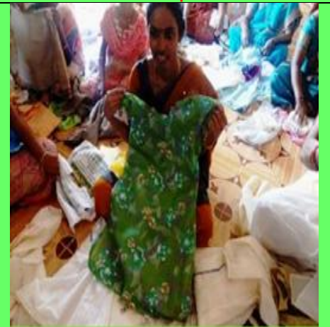
One of the Beneficiaries Displaying the finished the girls Kurtha