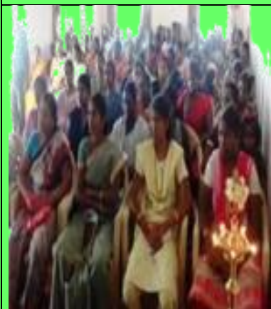
Beneficiaries during the training