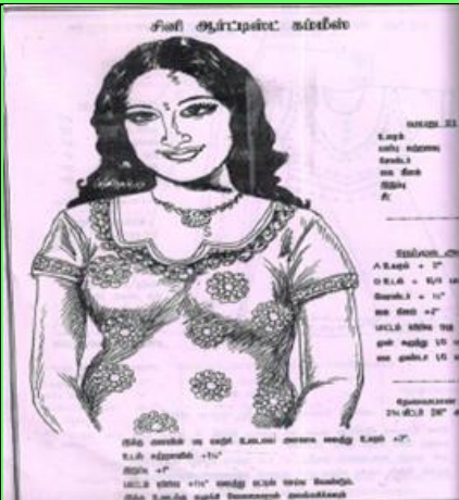
Cini Artists Commies